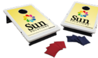
BAG TOSS GAME