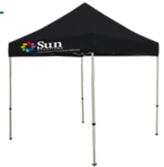
DELUXE 8' TENT